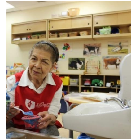
HS/EHS Children's Program Eligibility

The Head Start Act establishes income eligibility for participants based on the Poverty Guidelines updated annually by the US Department of Health and Human Services. Northside Center’s Head Start and Early Head Start income eligibility is reported as indicated below. Sixty-nine percent of Early Head Start families and seventy-three percent of Head Start families enrolled fall below the federal poverty guidelines for a family of four. Nineteen percent of EHS children and four percent of Head Start children are homeless. One percent of EHS children and seven percent of Head Start children are in foster care and three percent of EHS children and eleven percent require temporary assistance. Four percent are over income in Early Head Start and six percent are over income in Head Start. This is in part due to our service of special needs children. One percent of our Early Head Start and 30% of our Head Start children are classified as special needs.